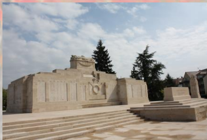
taken April 2014